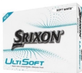
Srixon Ulti Soft White: $25 Per Dozen