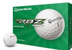
Taylor Made RBZ TM 21 Soft Feel White $25 Per Dozen