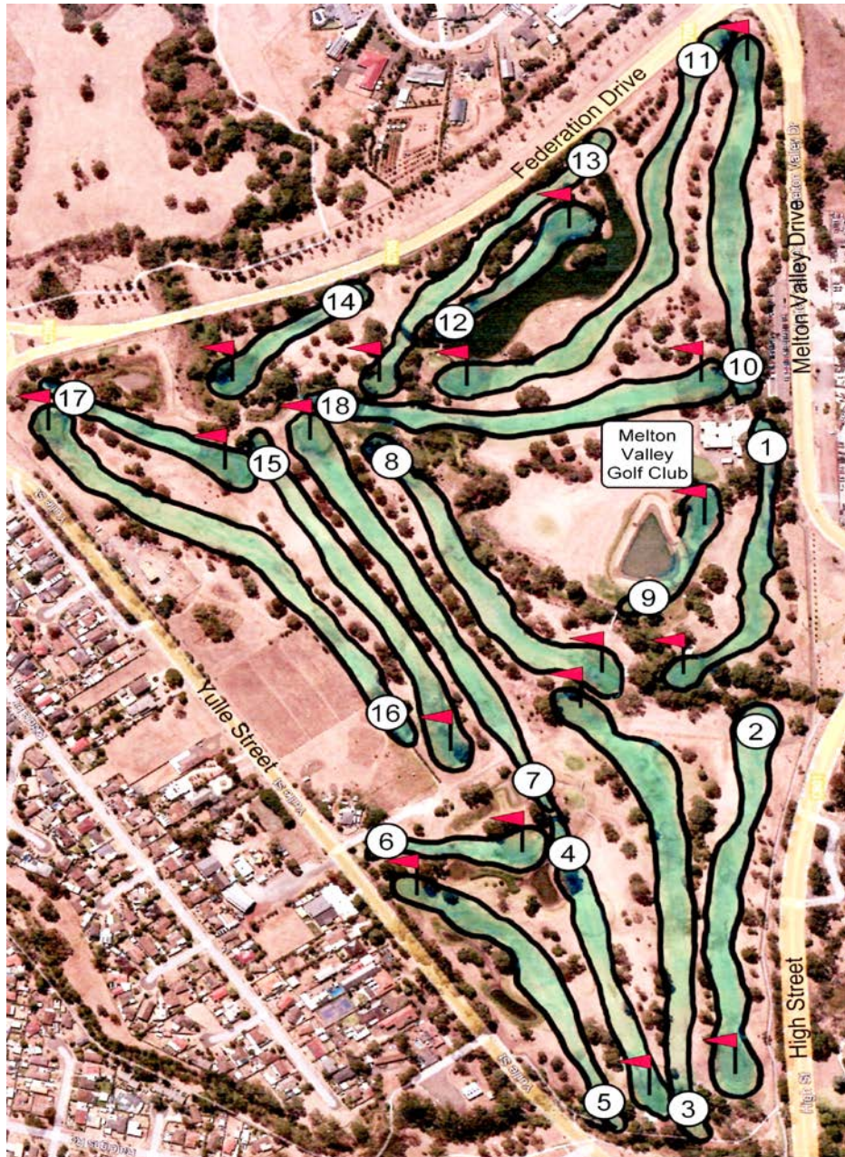
Melton Valley Golf Course