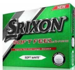
Srixon Soft Feel White: $25 Per Dozen