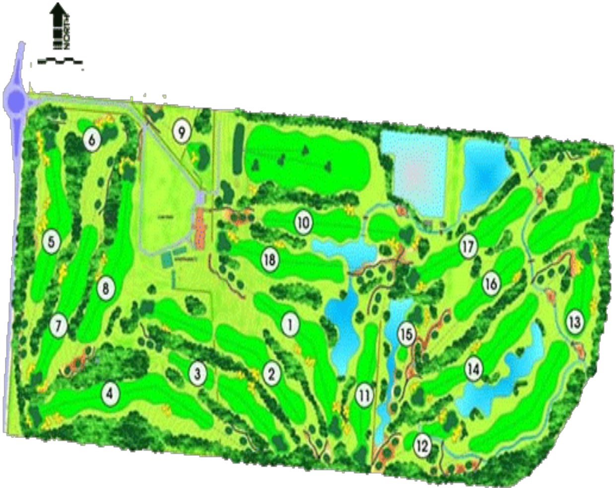
Mt Derrimut Golf Course