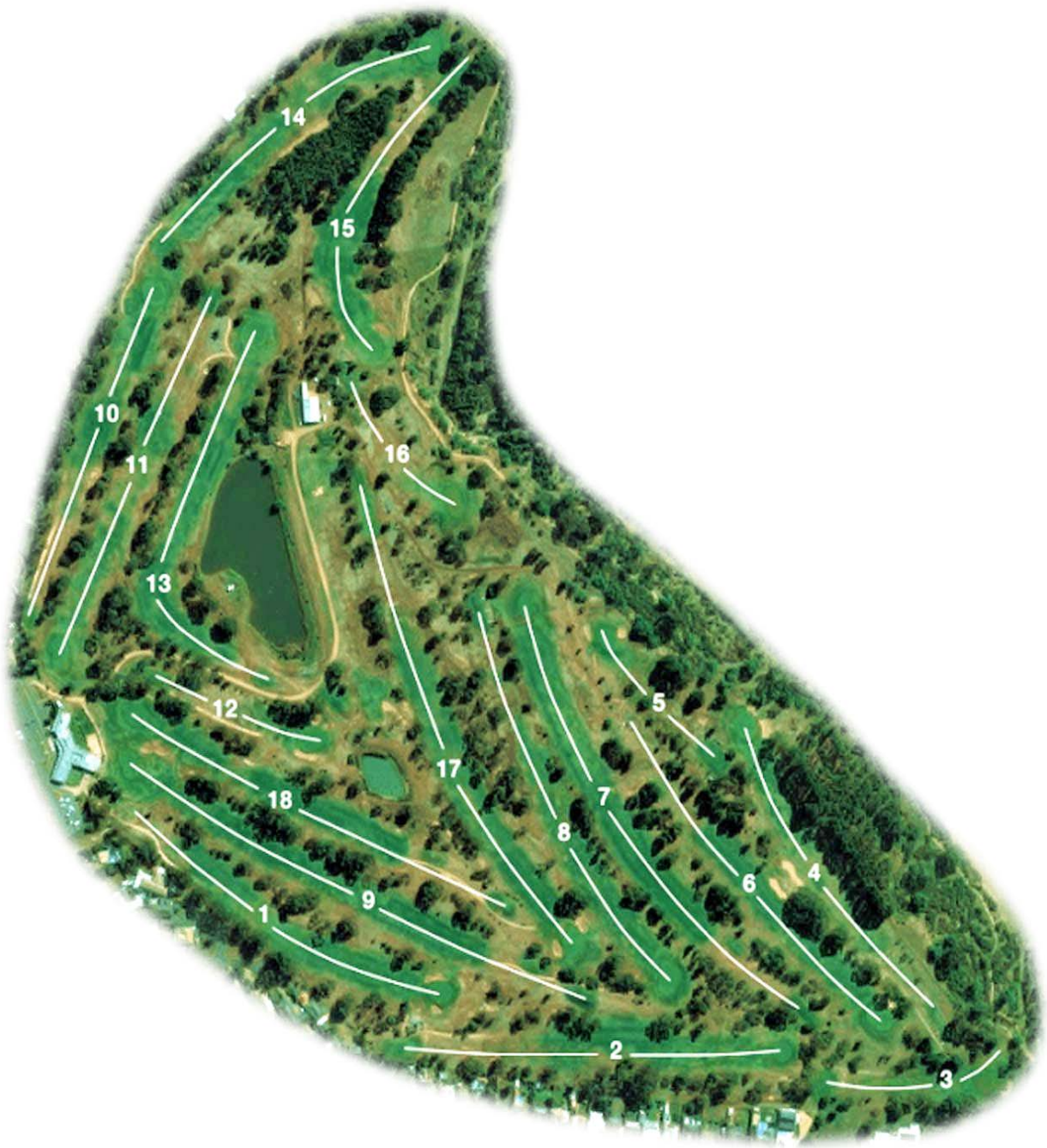
Bacchus Marsh Golf Course